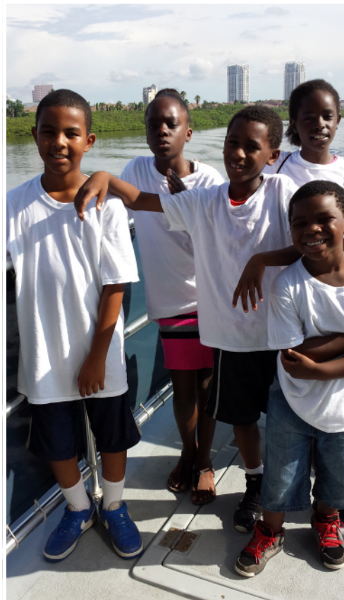
Boat Ride Around the Bay!