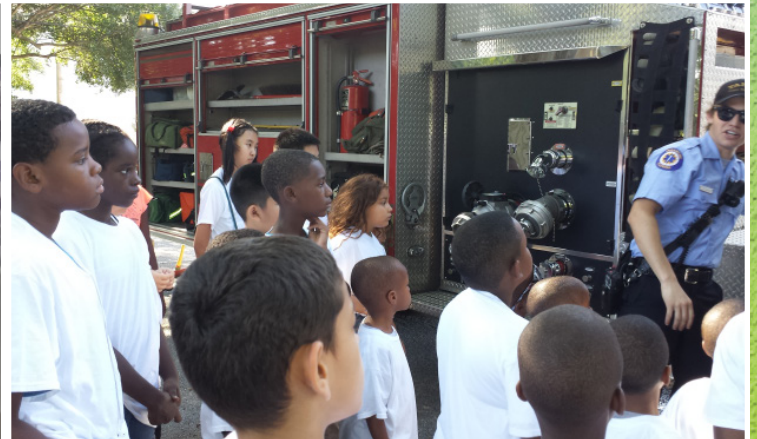
Fire Department Station #12