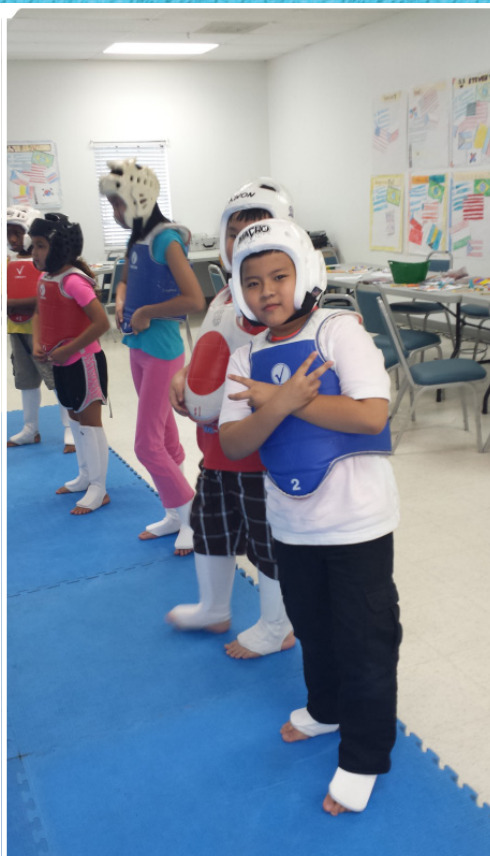
Master White's TaeKwonDo