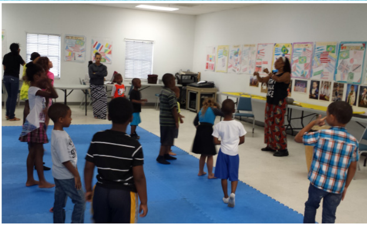
Kuumba Dance & Drums