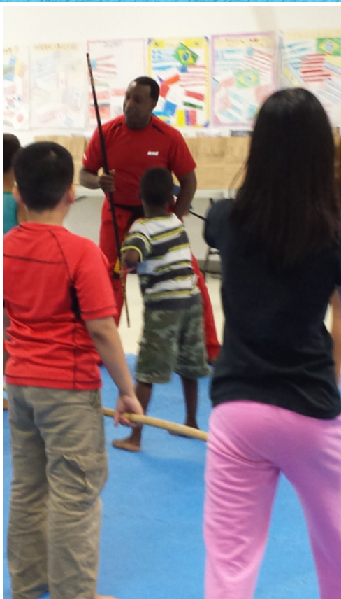
Master White's TaeKwonDo