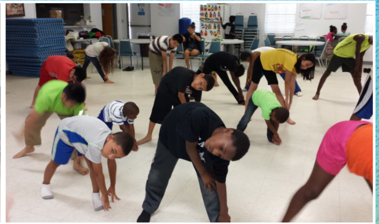
Kuumba Dance & Drums