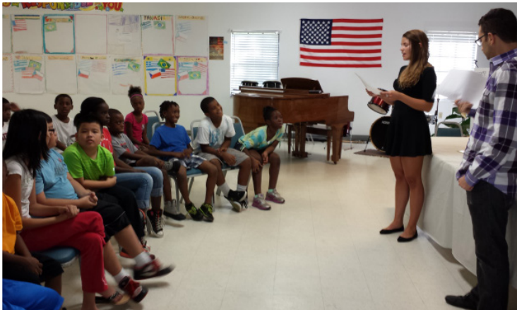
USF Students taught the children about nutrition