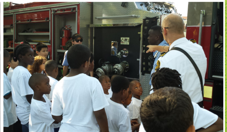
Fire Department Station #12