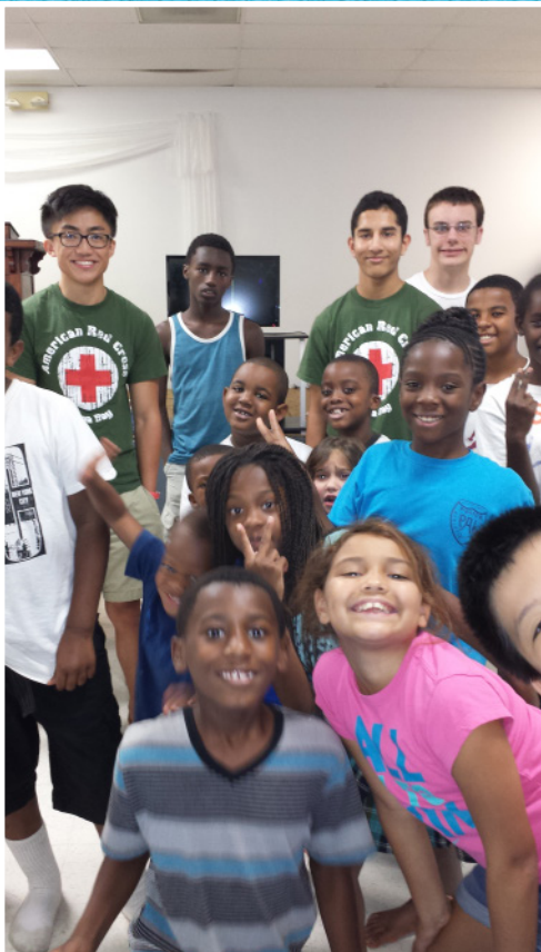
The Red Cross