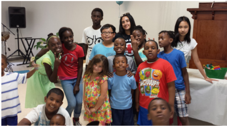
The Red Cross