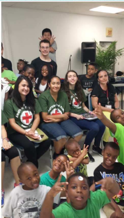
The Red Cross