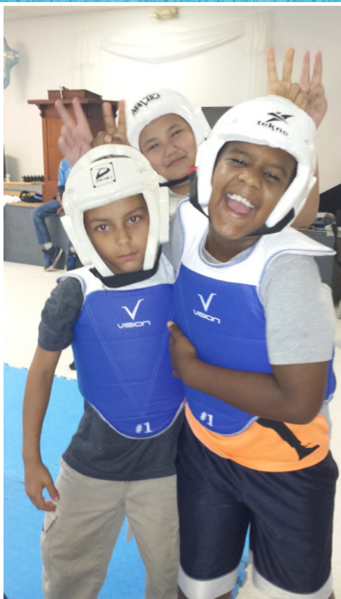
Master White's TaeKwonDo